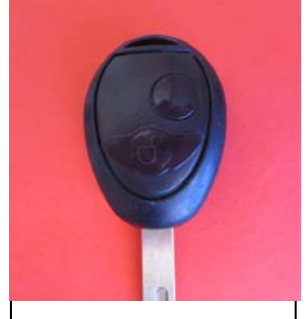
8. Re-assemble remote in reverse order. No reprogramming needed.