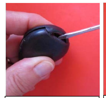
1. Prise open your remote using flat screwdriver.