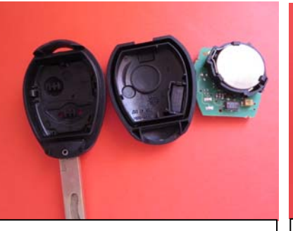
2. Separate electronic parts from plastic shell. Do not remove battery.