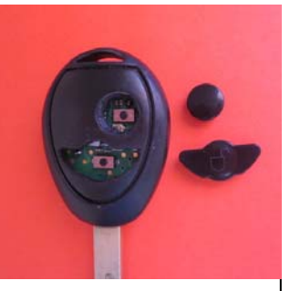
7. Push new buttons in. NO glueing needed.