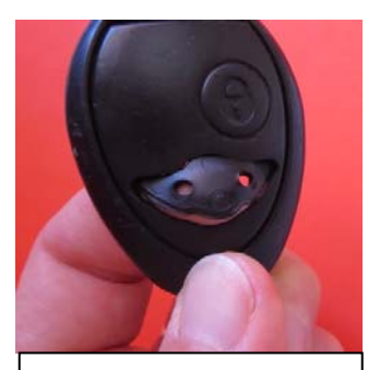
4. Push out back mounting plate from top shell to make room for new button.