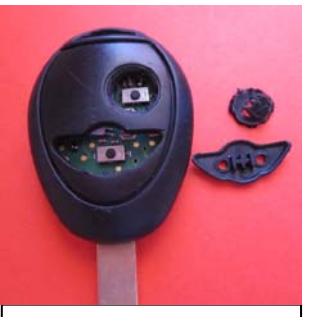
6. When both buttons are removed, remote is ready for fitting our silicone button in.