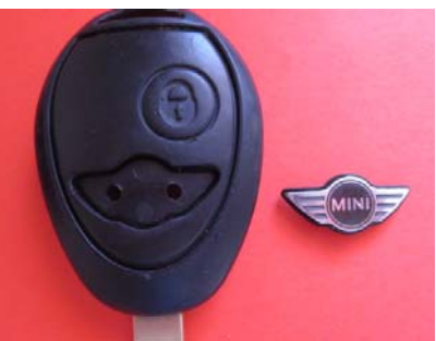
3. Remove Silver Wing (if still attached to back mounting plate), by peeling it off.